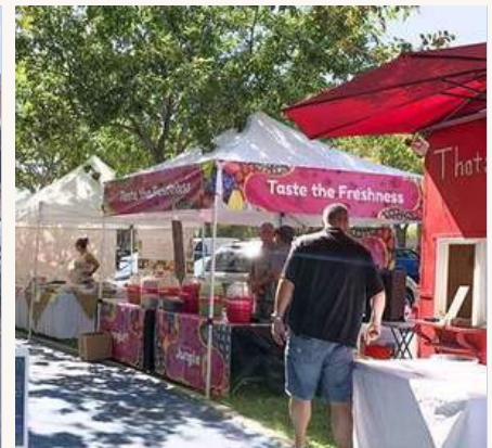
BRUCE TRENT PARK (WEDNESDAYS)

One of the more established markets with a mix of food, vendors, and live music.