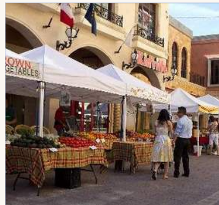
FRESH52 AT TIVOLI VILLAGE (SUNDAYS)

A more laid-back, scenic setting—perfect if you want a quieter morning.