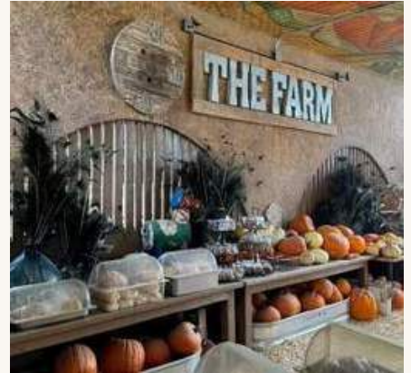
THE LAS VEGAS FARM (WEEKENDS)

Great midweek option with a strong community feel.