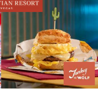
Turkey and the WOLF