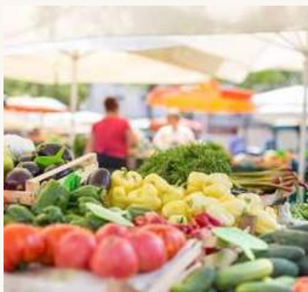
FLOYD LAMB PARK (SATURDAYS)

A little more rustic, a little more unexpected—and worth checking out.