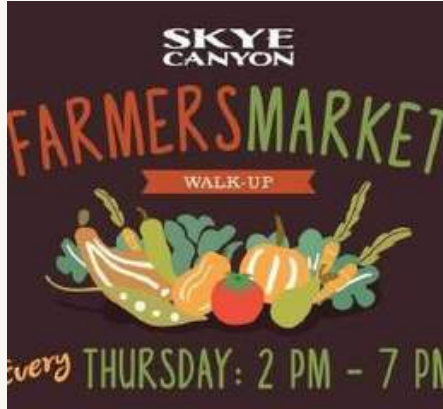
SKYE CANYON (THURSDAYS AFTERNOONS)

A local favorite. Easy to pair with coffee, shopping, or brunch.