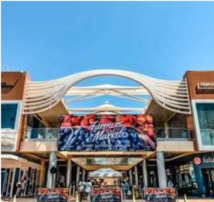
DOWNTOWN SUMMERLIN (SATURDAYS)

A local favorite. Easy to pair with coffee, shopping, or brunch.